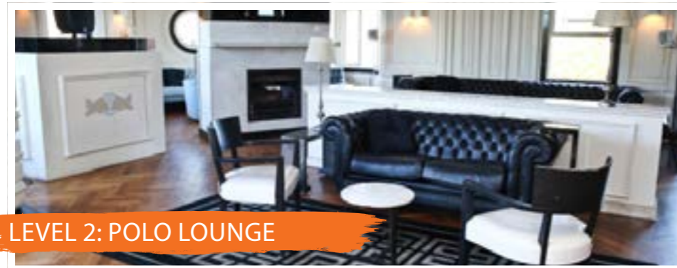
LEVEL 2: POLO LOUNGE

The Oxford Hotel is a multi-space venue featuring three uniquely different function and entertainment spaces. The different spaces are ideal for any occasion including corporate events, birthday parties, social gatherings and live entertainment events.